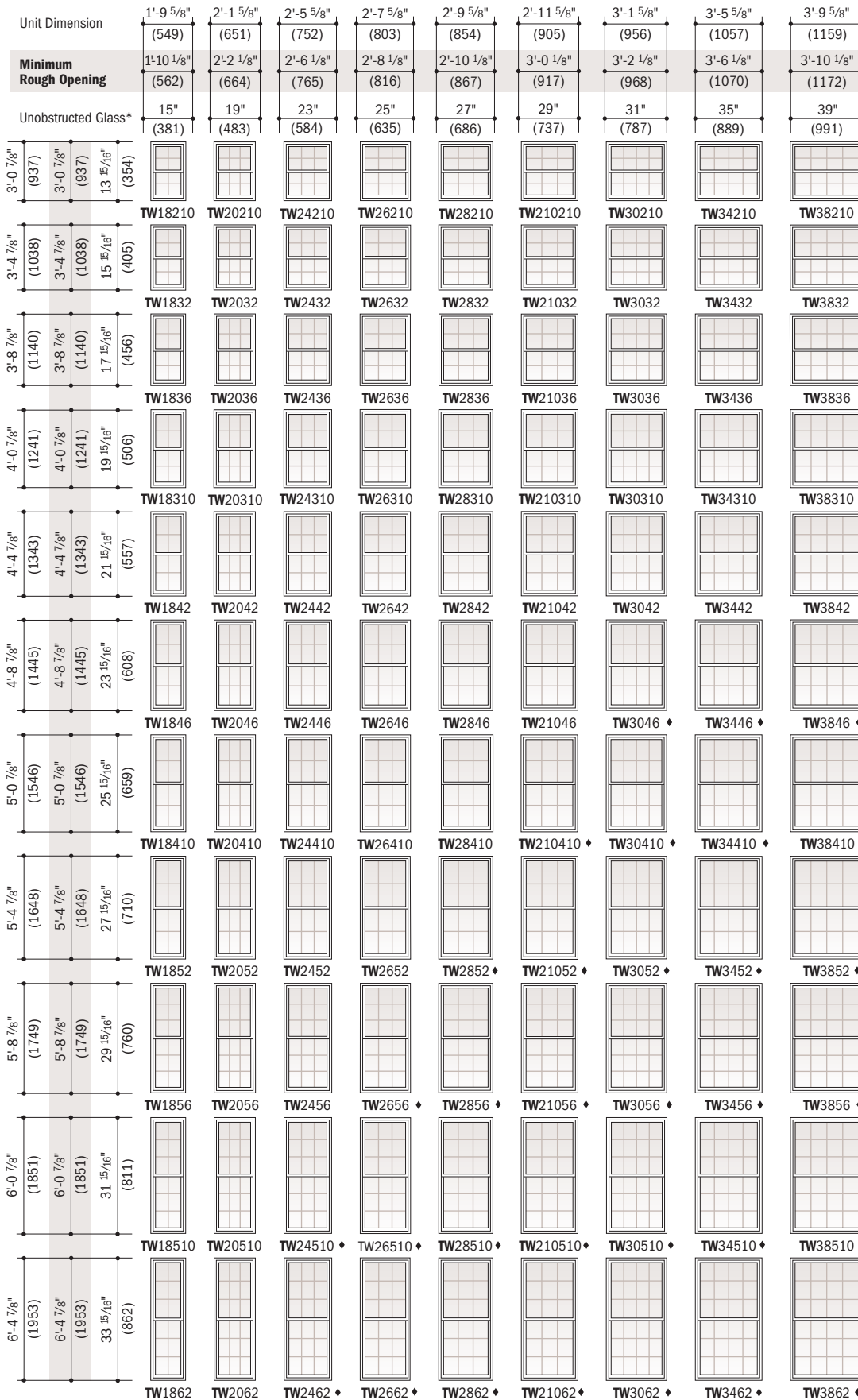
Table of Basic Unit Sizes Scale 1/8" = 1'-0" (1:96)

Cottage Style Units Available for these heights, in all widths. Contact dealer for lead times.